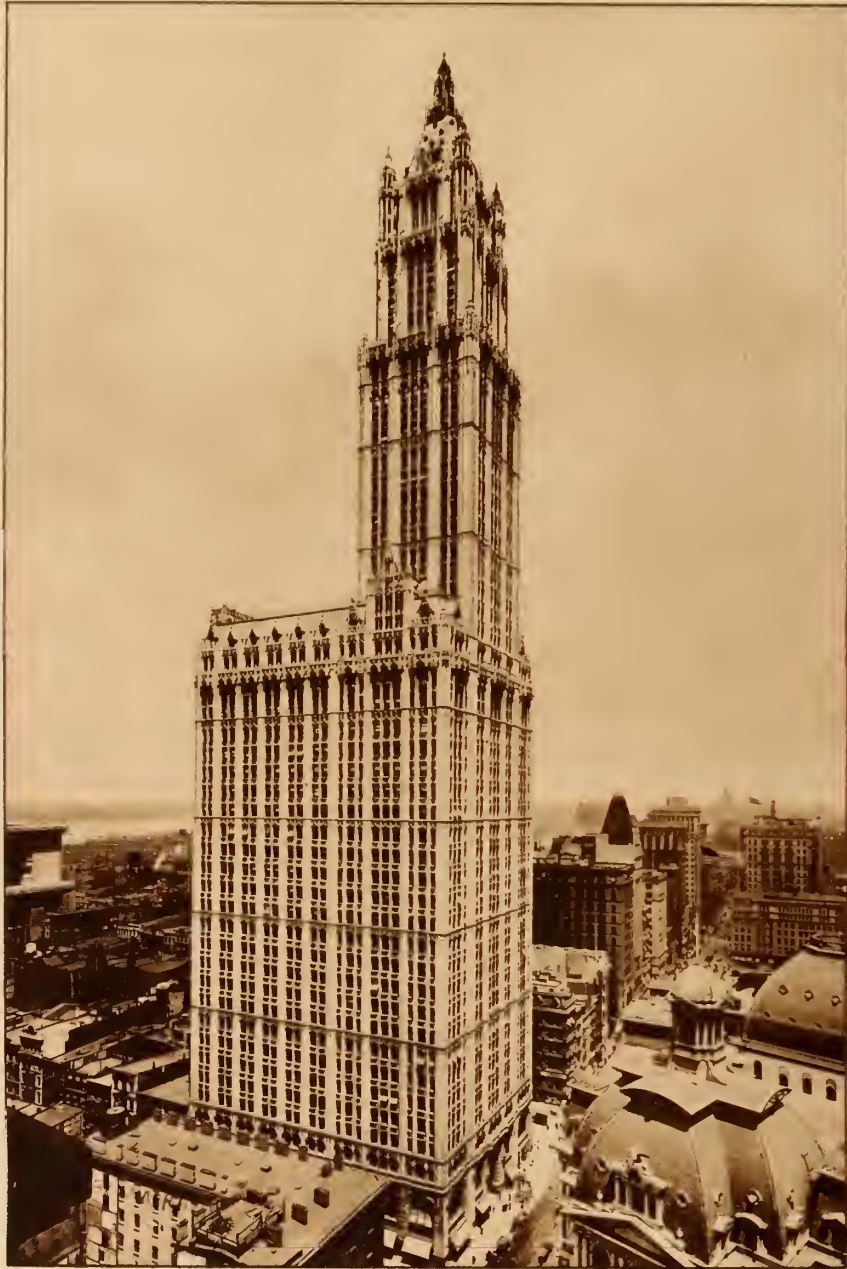
WOOLWORTH BUILDING, situated on Broadway. Tallest office building in the world. Cost $14,000,000, including site. Fifty-five stories and 793½ feet high. American Studio